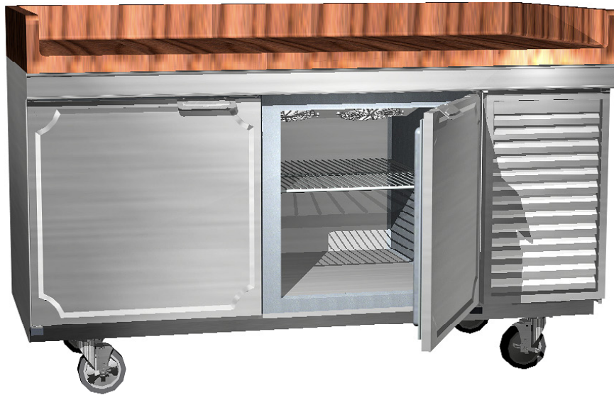
2562-BMT shown with options

Maple Top - Bakers Table Only Self-contained